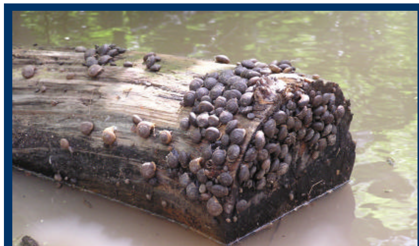
Snails seek high ground in N. Texas flooding