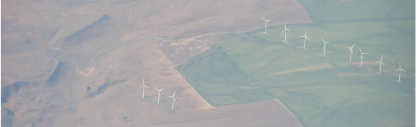
Wind Farm from the air.