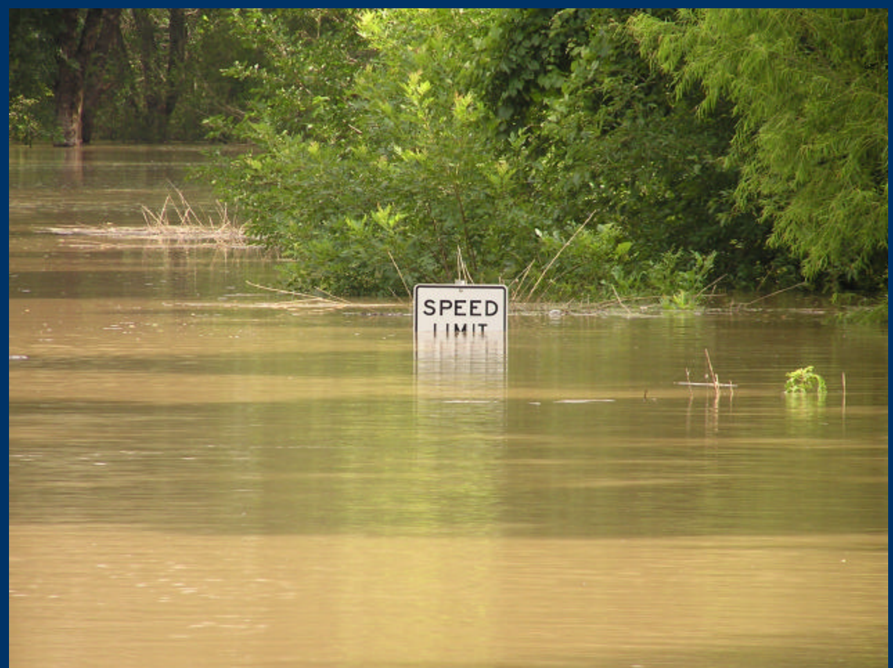
North Texas, Spring 2007. Weeks of flooding occurred in North Texas last spring, following years of drought.

An issue devoted to Global Climate Change Issues