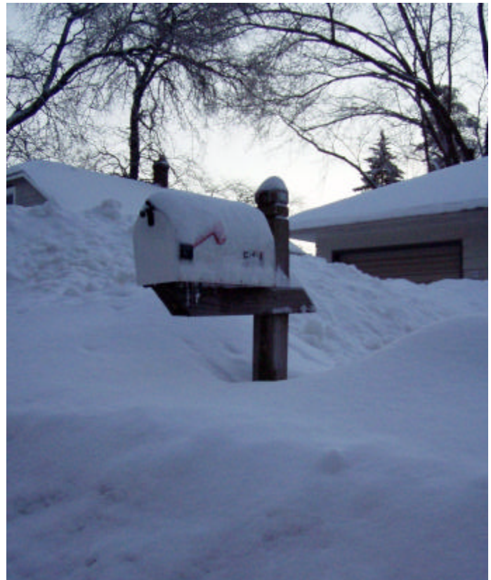
Madison, Wisconsin mailbox, February 2008